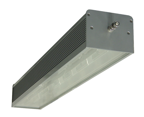
FL40 FL Series Wall Wash Fixture

Applications include: Landscape Signage, Buildings, Structures and Parking Lots